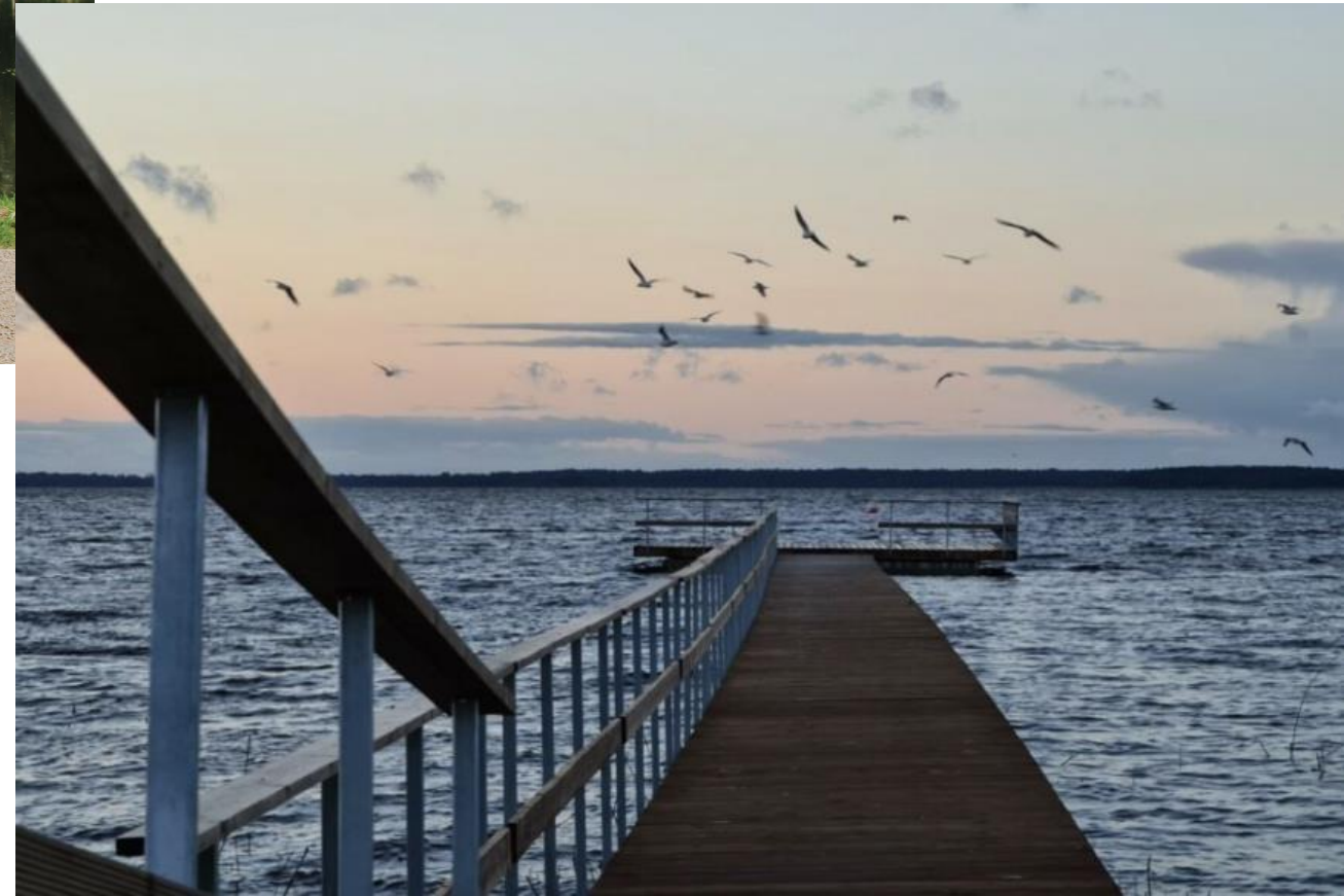
Pontoon footbridge in Burtnieki