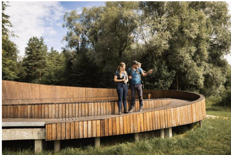
Gauja National Park