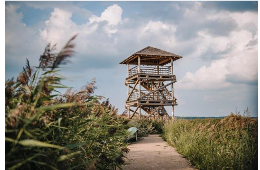
Nothern Vidzeme Biosphere Reserve