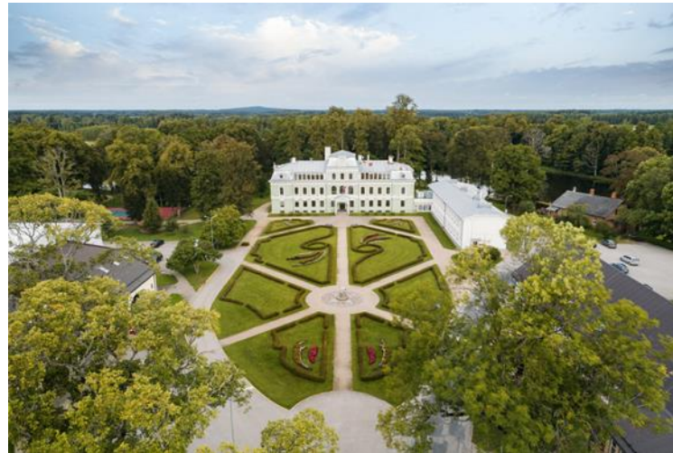
A network of manors