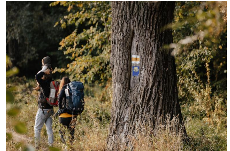
Camino de Santiago