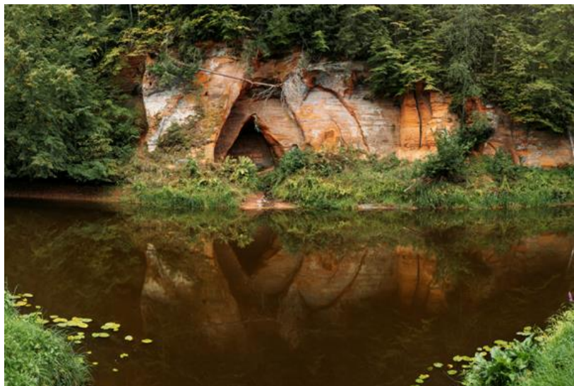
Salaca river & Skanaiskalns nature park