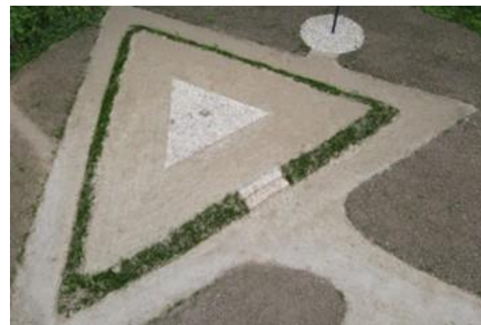
Installation of Storiiai educational path

Implementation of Interreg project „Creation of international tourist route „The Struve Geodetic Arc““, No. LLI-477, acronym – STRUVE