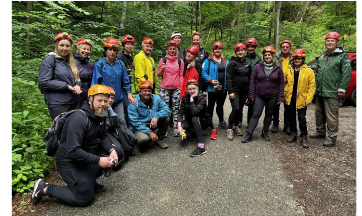
Study visit in Czech Republic