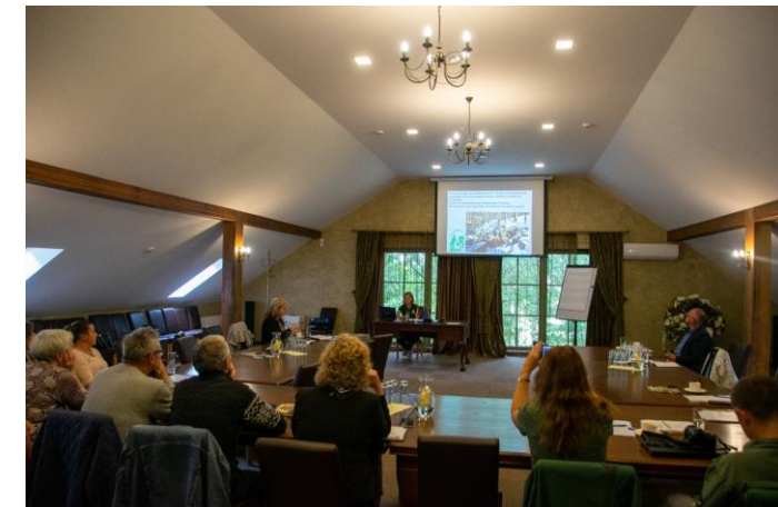
Seminar about karst processes