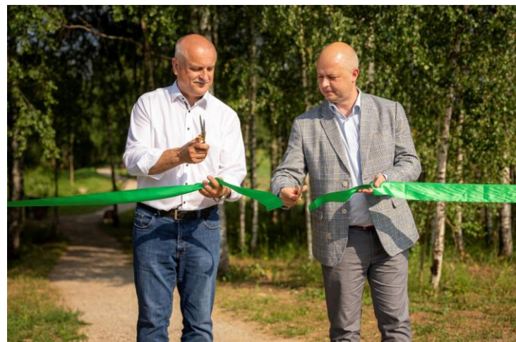
Opening event of the path