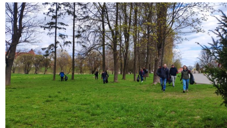
Events of Širvėna lake cleaning