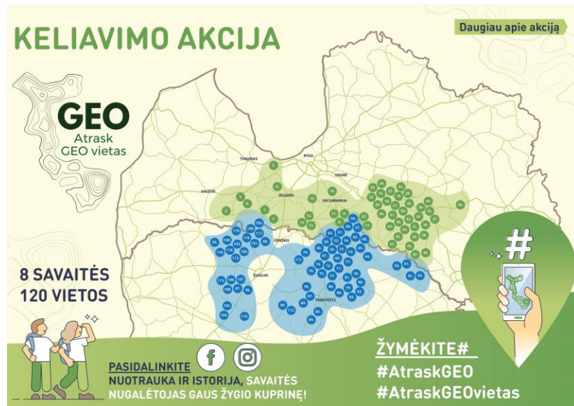
Action „Find GEO places“

Implementation of Interreg project „Use of Unique Geological and Geomorphological Nature Values in the Development of Green Cognitive Tourism“, No. LLI-483, acronym – GEOTOUR