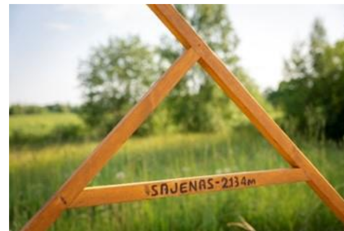
Outside exposition elements in the path