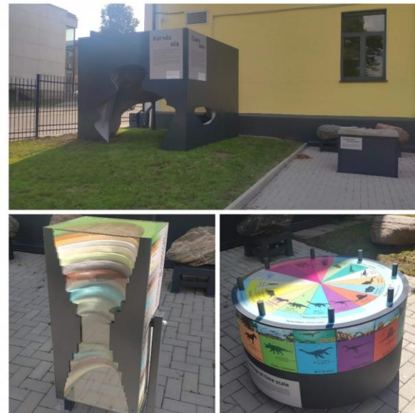
Outside exposition in Biržai RP visitor center