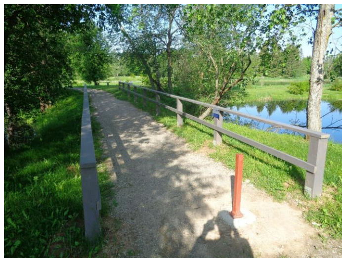
Management of gypsum karst lakes and their surrounding areas

Implementation of Interreg project „Improving Governance and Management of Lakes in Kurzeme and North Lithuania”, No. LLI-449, acronym - LIVE LAKE