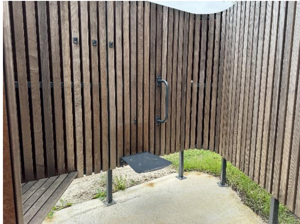
Example from the accessibility assessment