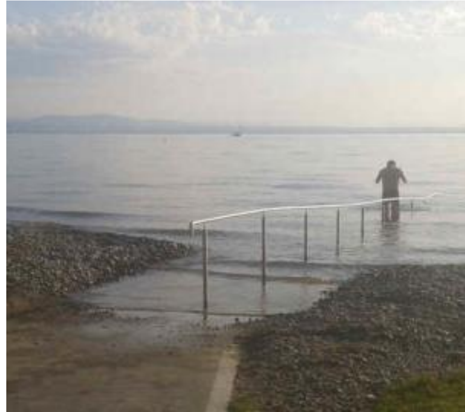
Example from the accessibility assessment