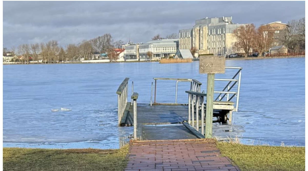
Example from the accessibility assessment