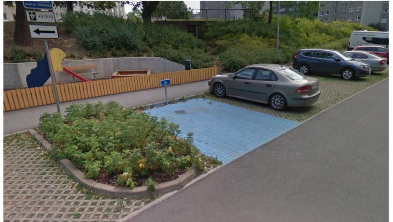
Example from the accessibility assessment