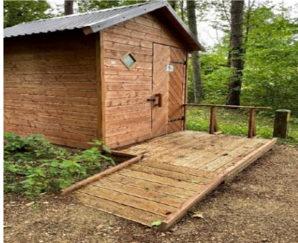
Example from the accessibility assessment