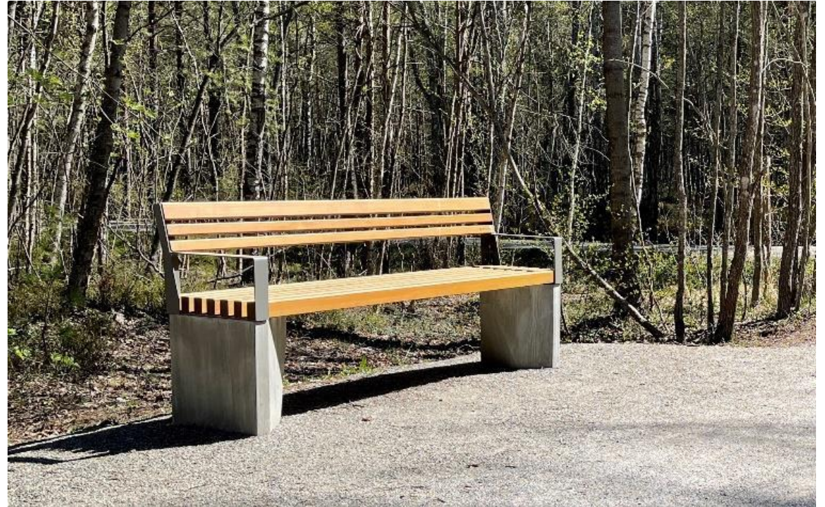
Example from the accessibility assessment